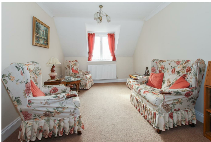
Flat 24 Brook Lodge Rear Of 157-165 High Street, Ongar, CM5 9JX

TOTAL APPROX. FLOOR AREA 691 SQ.FT. (64.2 SQ.M.) THIS PLAN IS FOR ROOM IDENTIFICATION ONLY, AND ITS ACCURACY IS NOT GUARANTEED. www.epcsinsex.co.uk Made with Metropix ©2018